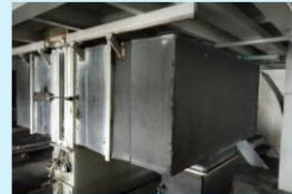
3. The melt pp will be delivered to the spinning pump and spin, fine draw, the melt pp changes into superfine fiber.