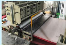
4. The stretched superfine fiber is transferred to the web former. Forming the embryonic form of non woven pp spunbond fabric.