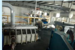
2. Polypropylene is conveyed to the inside of the machine body and melt