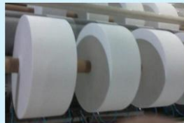
5. The non woven fiber web transferred to hot calender by net screen and will be high temperature pressed by hot calendar, rolling up, cut off the edges on both sides, eventually become a non woven roll.