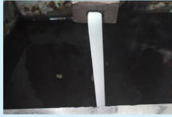
2. Extruded the plastic strip