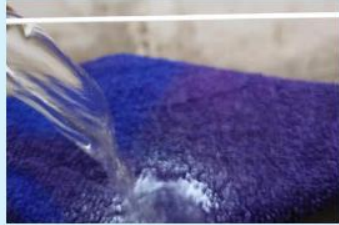
5. Cooling down the temperature for the second time