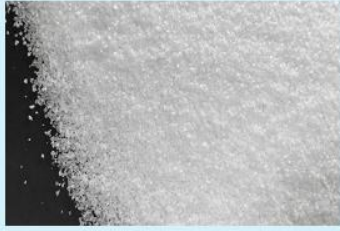
1. Configure and mix the raw materials