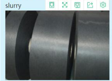
4. Cut into different width according to client's request. Packing by PE bags and stock in clean, ventilated and dry stockroom